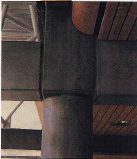
Aesthetically pleasing precast frame connections can now be easily accomplished using BSF.